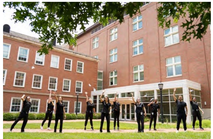
How do they make masks look so good?