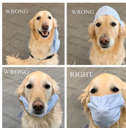
Remington, another service dog on UNC's campus, shows the right and wrong ways to wear your mask during a Pandemic!